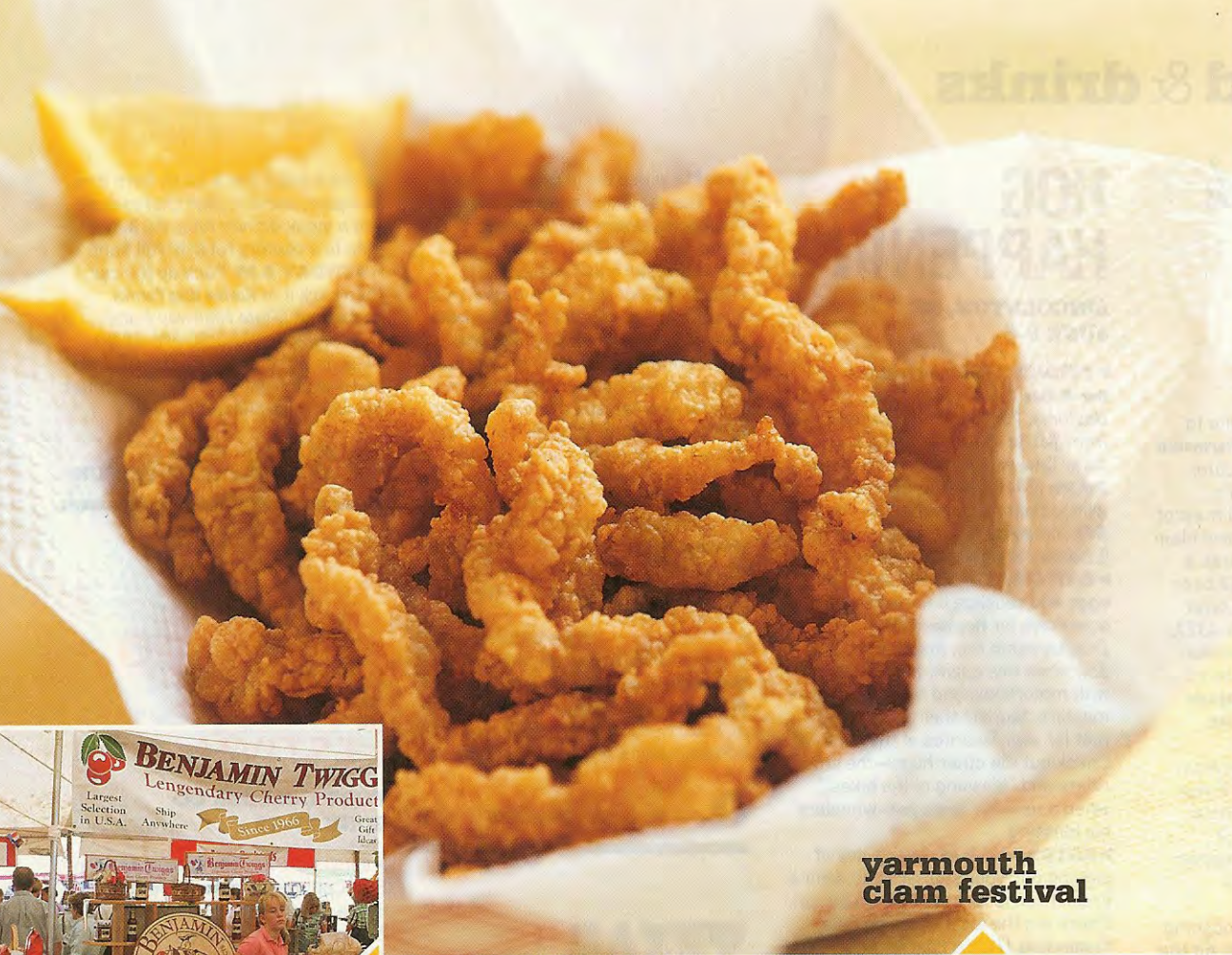
yarmouth clam festival